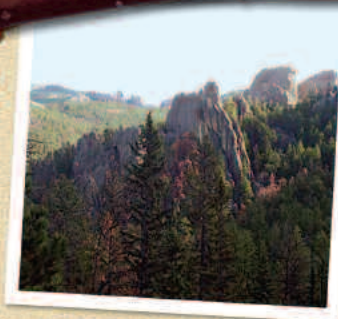
CUSTER - SEE THE HILLS FROM HERE!