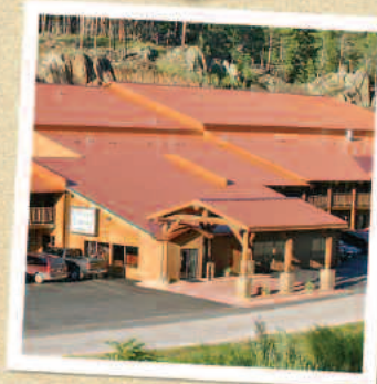
RUSHMORE EXPRESS AND FAMILY SUITES