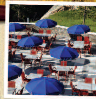
MOUNT RUSHMORE CONCESSIONS / XANTERRA PARKS + RESORTS