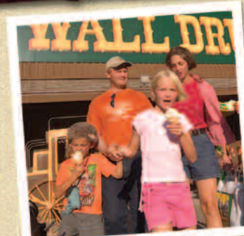
WALL DRUG STORE