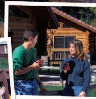
BED & BREAKFAST INNKEEPERS OF SOUTH DAKOTA