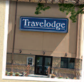
MOUNT RUSHMORE TRAVELODGE & RV