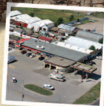
PIONEER AUTO SHOW AND PRAIRIE TOWN