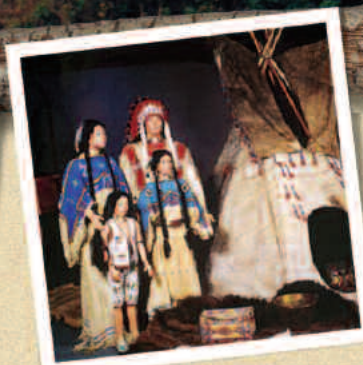
AKTA LAKOTA MUSEUM AND CULTURAL CENTER